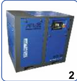
2 SCREW AIR COMPRESSOR /ROTARY TYPE (SILENT COMPRESSOR) 7.5 HP TO 100 HP