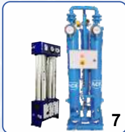
7 HEATLESS/DECANT AIR DRYER 20 CFM TO 200 CFM