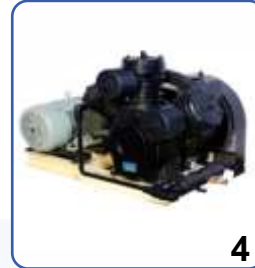
4 OIL FREE AIR COMPRESSOR 02 HP TO 10 HP