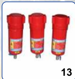
13 PRE-FILTER/ LINE FILTER 20 CFM TO 800 CFM