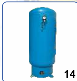
14 AIR STORAGE TANK/ AIR RECEIVERS (VERICAL & HORIZONTAL TANK) 10 LTR TO 10,000 LTR UP TO 40 BAR