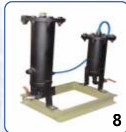
8 MOISTURE & OIL SEPARATOR