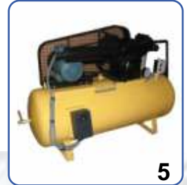
5 VACUUM PUMP 02 HP TO 10 HP