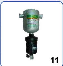
11 MOISTURE SEPRATOR 20 CFM TO 100 CFM