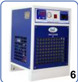
6 REFRIGERATED AIR DRYER 20 CFM TO 800 CFM