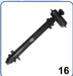
16 WATER COOLED AFTER COOLER 40 CFM TO 800 CFM