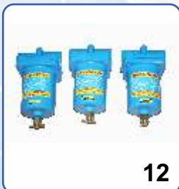
12 THREE STAGE FILTER 20 CFM TO 800 CFM