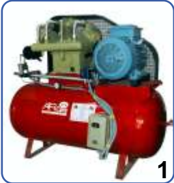
1 RECIPROCATING AIR COMPRESSOR / (PISTON TYPE) 1 HP TO 15 HP