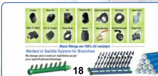
18 COMPRESSED AIR PIPE LINE (PPR FIBERTERM) AS PER REQUIREMENT