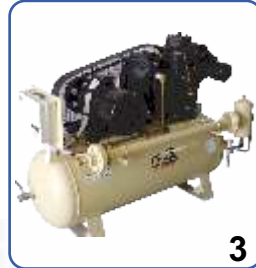
3 HEIGH PRESSURE AIR COMPRESSOR @25 Bar (LASER MACHINE) 3 HP TO 20 HP