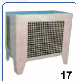
17 AIR COOLED AFTER COOLER 40 CFM TO 800 CFM