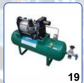
19 BOOSTER TANK 10 LTR 100 LTR

*Technical Specifications are subject to change without prior notice due to constant up gradation of products