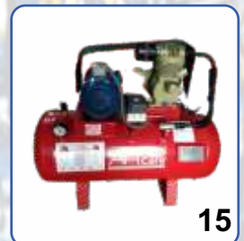
15 PORTABLE COMPRESSOR (1 HP)