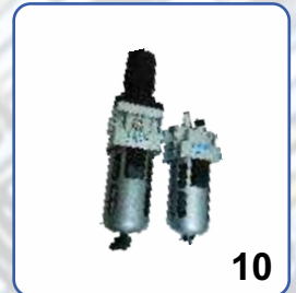
10 FRL 1/2"