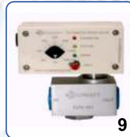
9 AUTO DRAIN VALVE 220V